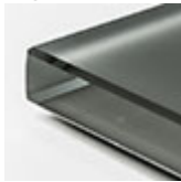
extra clear frosted glass graphite painted