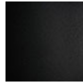
GFM73 black embossed