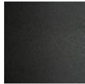
GFM69 graphite embossed