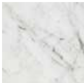
BCO matt white Carrara