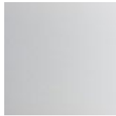
GFM71 white embossed