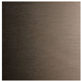
11 satin titanium