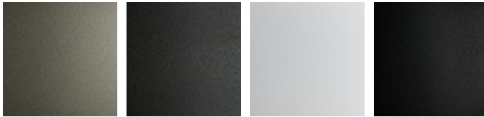
GFM11 titanium embossed