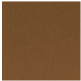
GF15 bronze embossed