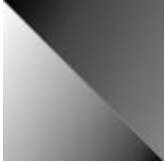
extra clear graphite