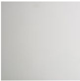
OP71 matt white