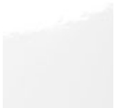
L7 polished white lacquered