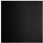
GFM73 black embossed