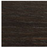
RB burned oak