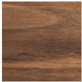
NC walnut canaletto