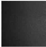
GFM69 graphite embossed