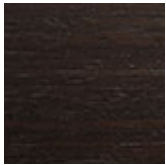
frRB burned oak stained ashwood