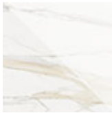
KM06 glossy Golden Calacatta