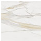
KM05 matt Golden Calacatta